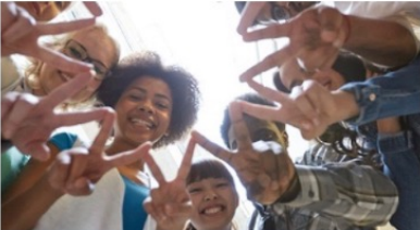
Coming to UniTrento

If you are considering spending a period of time in Trento, for study, work, internship or research